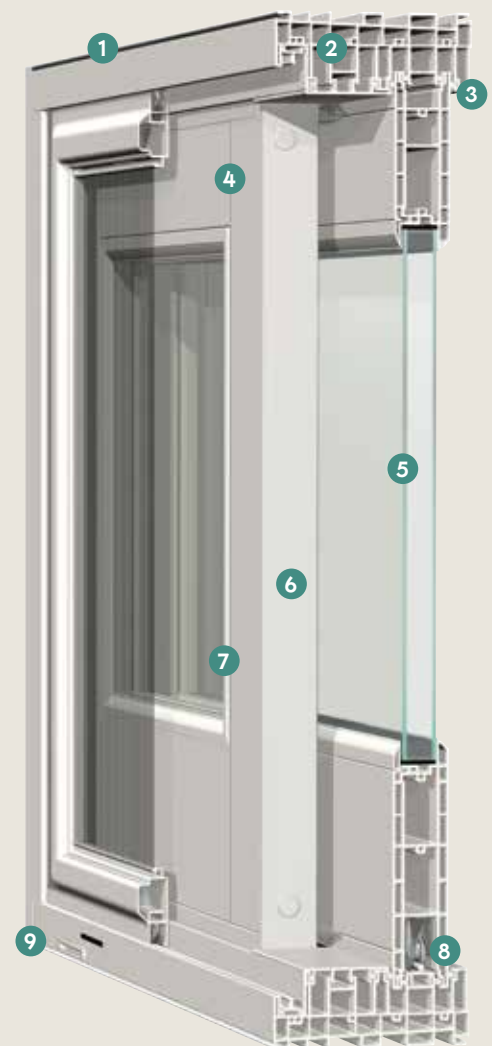
FRENCH-STYLE PATIO DOOR GLASS PERFORMANCE COMPARISON 2